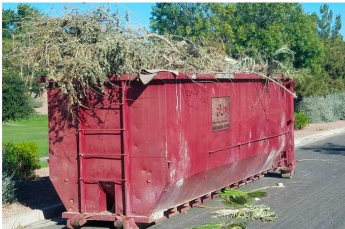
Do Not Overfill