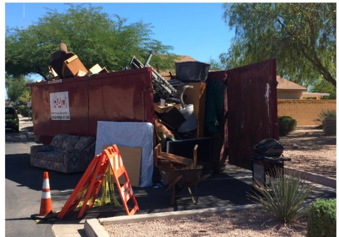
Do Not Place Items Outside of the Dumpster