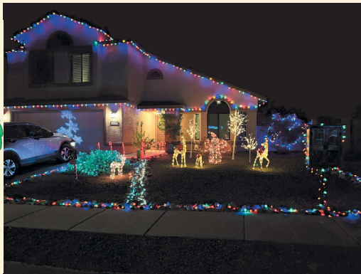
2nd Place - 4966 W Hurston