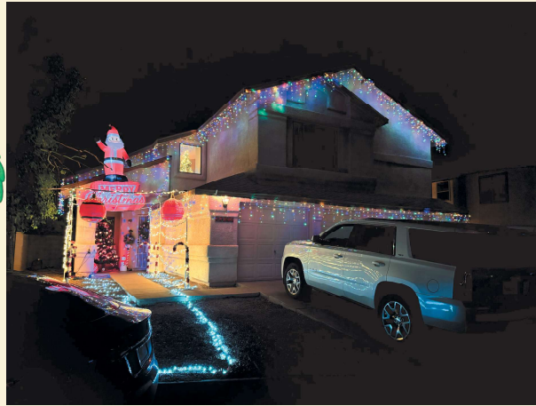
1st Place - 8871 N. Hersey