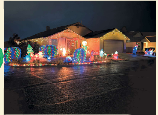
3rd Place - 4931 W Hurston